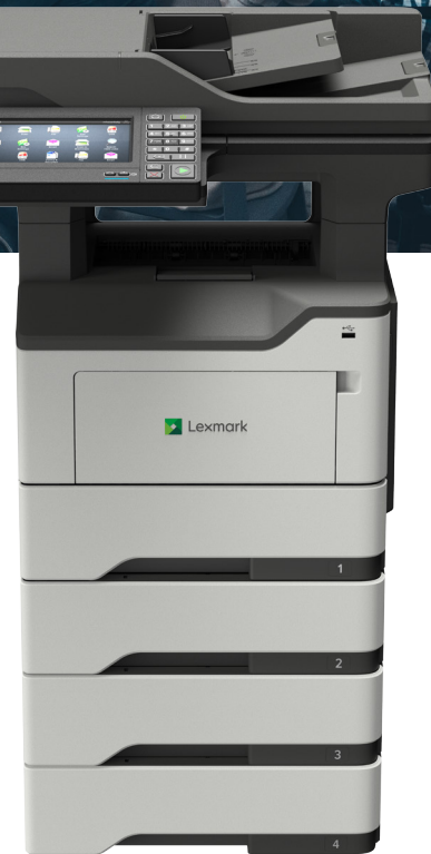
XM3250 with optional trays