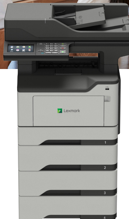
XM1246 with optional trays