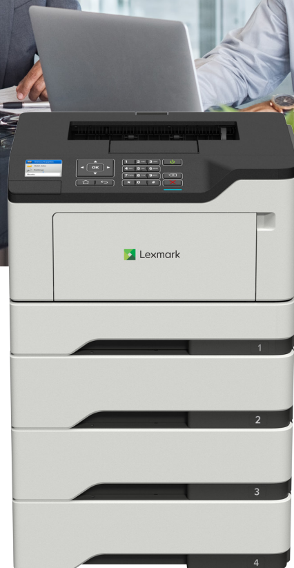
M1246 with optional trays